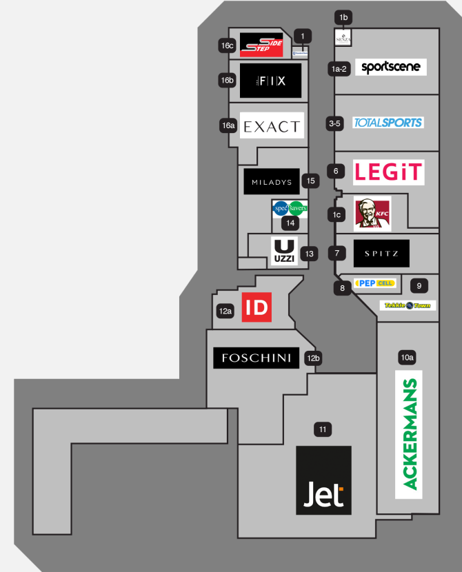
Upper Ground Level