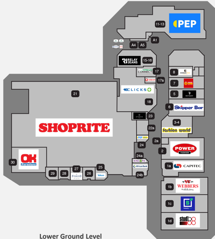
Lower Ground Level